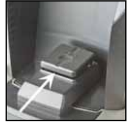
Photo #10 The narrow gap under the weighing platform MUST be free of ground coffee.

If the weight display does not count up properly when grinding coffee, remove the grounds bin and blow air under the weighing platform to clear any coffee grounds from the narrow gap under the platform. DO NOT use any type of tool under the weighing platform. (See photo #10)