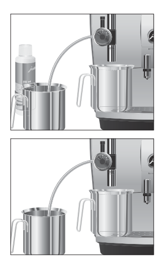
Dismantling and rinsing the cappuccino frother